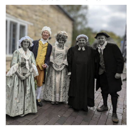
Three Hares Gallery