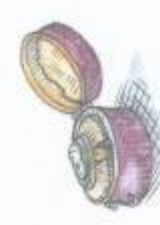
Cameo Ring in Case