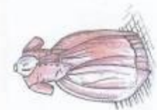
Georgian Party Dress