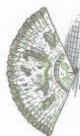
Lady Austen's Fan

"Absence of occupation is not rest; A mind quite vacant is a mind distressed." William Cowper