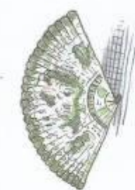
Lady Austen's Fan

"Absence of occupation is not rest; A mind quite vacant is a mind distressed." William Cowper