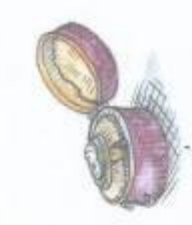
Cameo Ring in Case