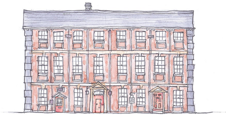
COWPER & NEWTON MUSEUM

The Dartmouth family owned land and buildings in the Olney area for many years. The 'Dartmouth Survey', dated 1796, includes information about the value of land and property owned by William Legge, 2nd Earl of Dartmouth.