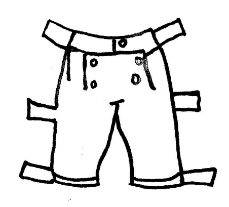
Colour, cut & attach with the tabs or